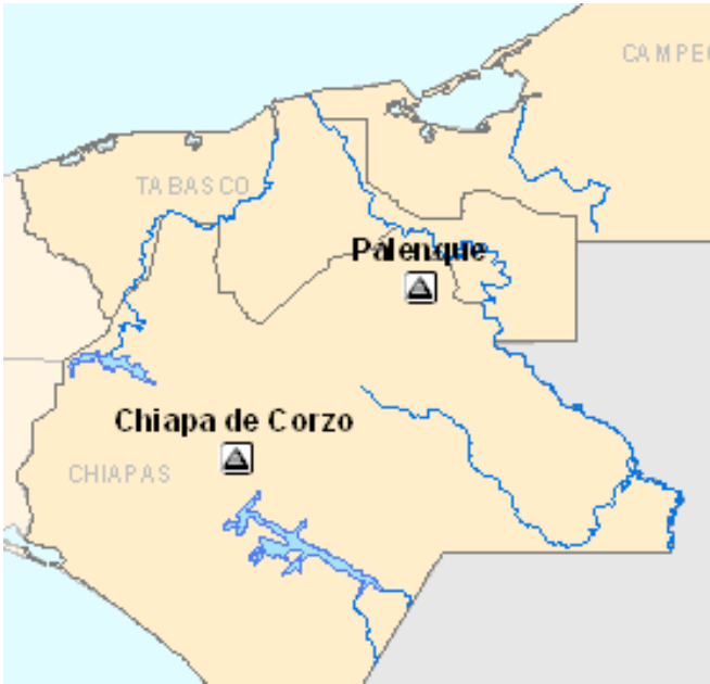
No River names.